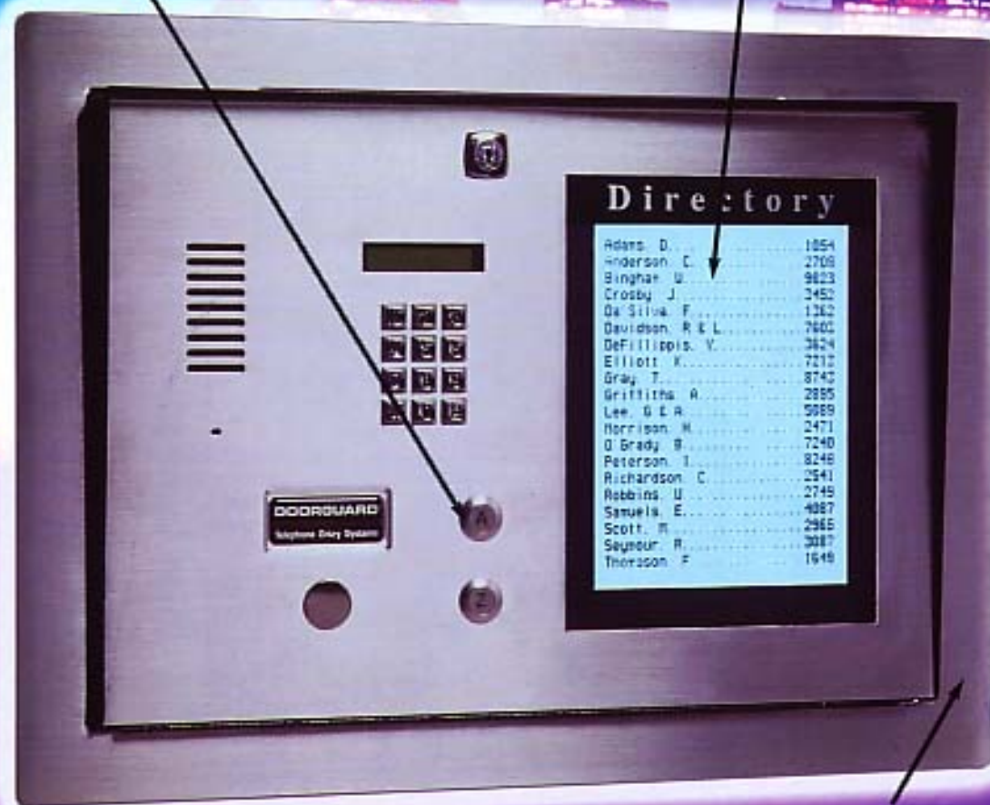
Model 7210/LCD (shown) 7250/LCD