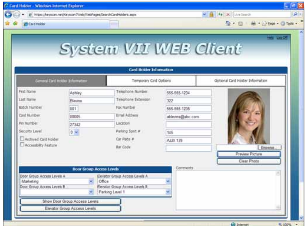
Card Holder Management