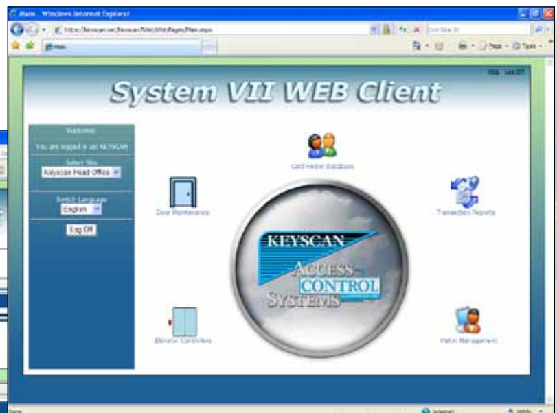
Main Web Page